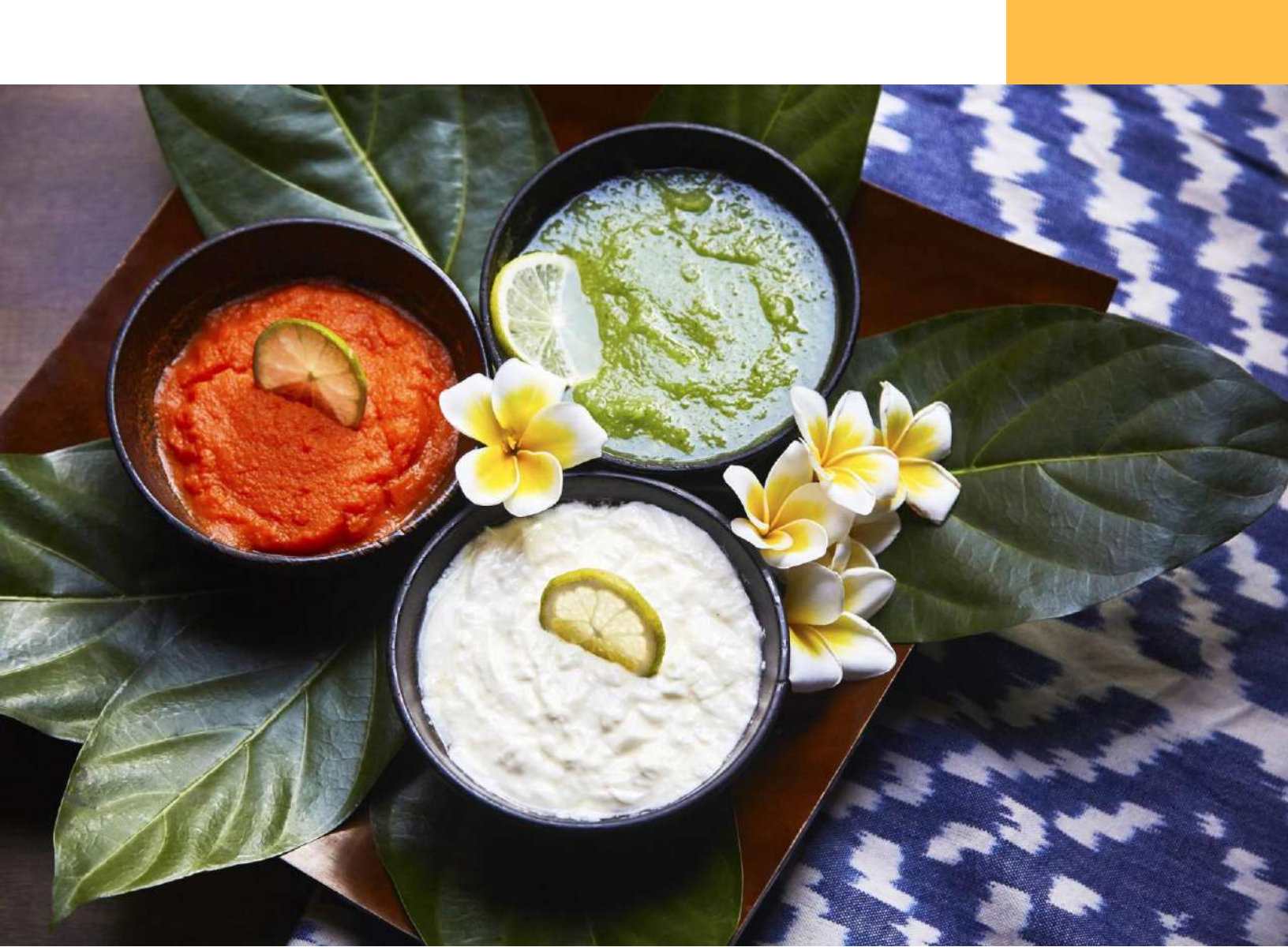
a la carte body treatment