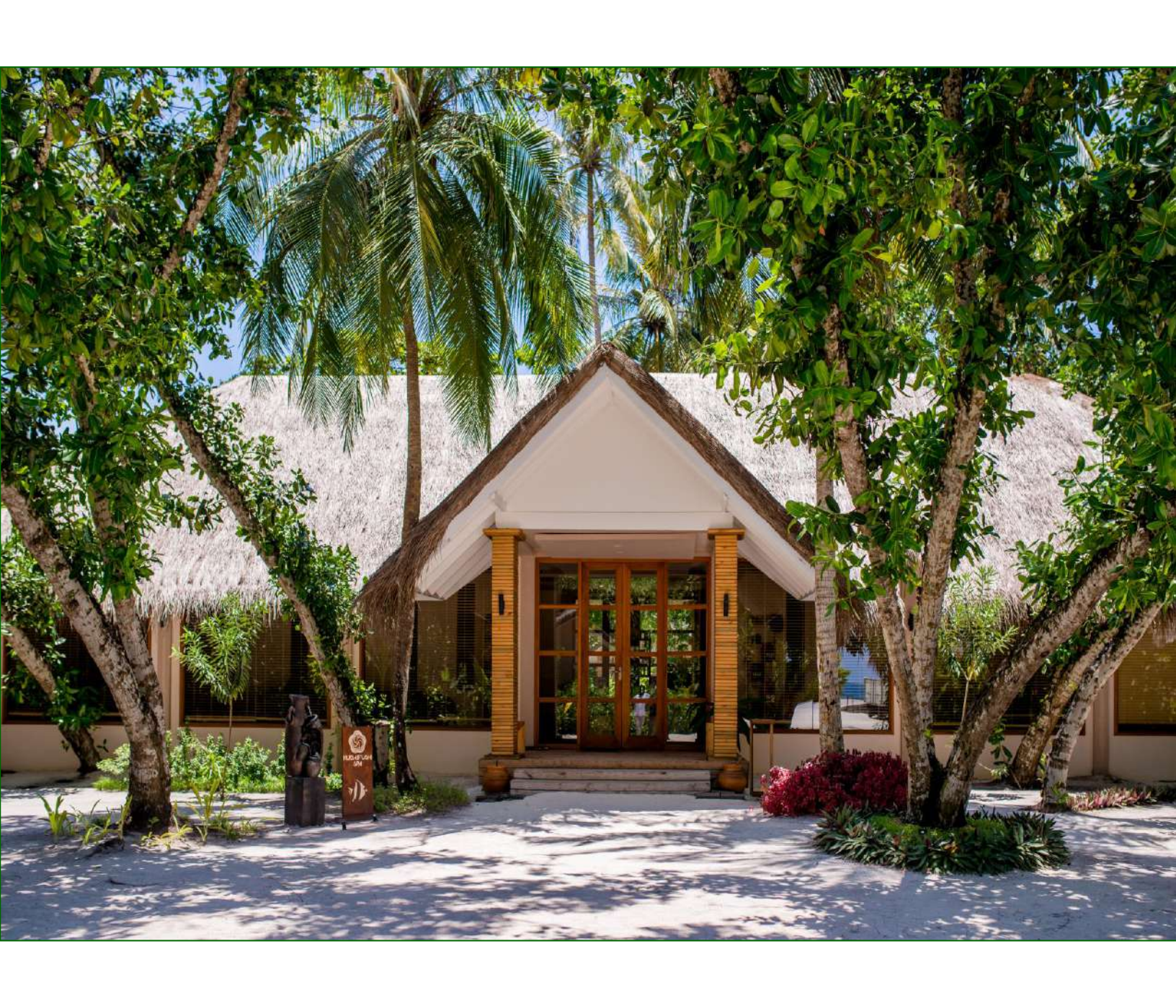
pure essence of ultimate wellbeing